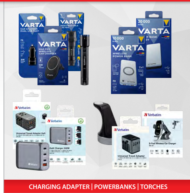
CHARGING ADAPTER | POWERBANKS | TORCHES

We offer a large selection of versatile charging adapters, high-performance power banks and reliable LED Torches.