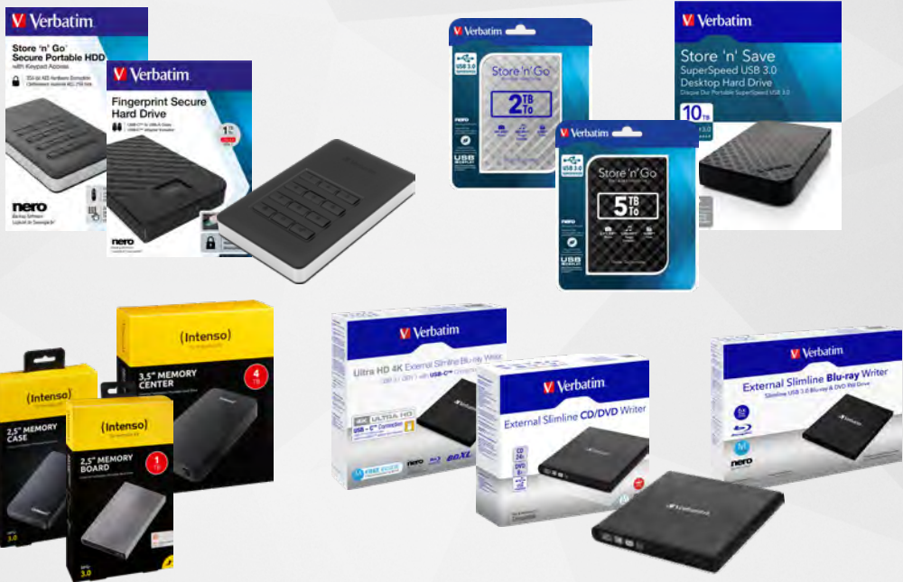
HARD DISK DRIVES | OPTICAL DISC DRIVES

We stock Hard Disk Drives in all common capacities, sizes and with all current interfaces. In addition, we offer various special Hard Disk Drives like security solutions. Our product range offers all common variants of internal and external Optical Drives (bulk & retail) as well as floppy disk drives.