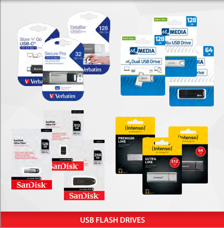
USB FLASH DRIVES