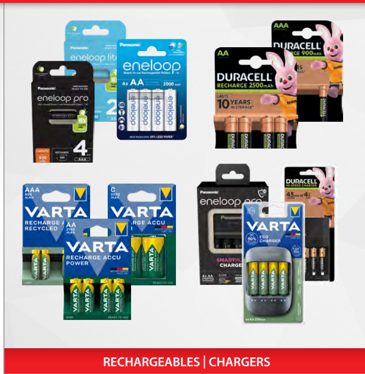
RECHARGEABLES | CHARGERS

In the area of Rechargeable Batteries, we also offer suitable chargers in addition to various designs and capacities.