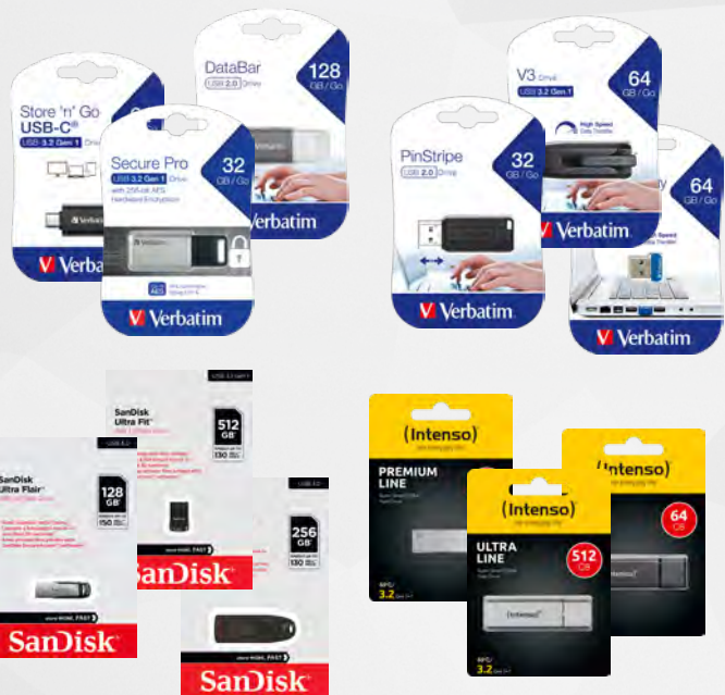
USB FLASH DRIVES

Our flash memory range in the area of USB Flash Drives includes all common capacities and connection types. In addition, we supply USB Flash Drives with encryption and special formats.