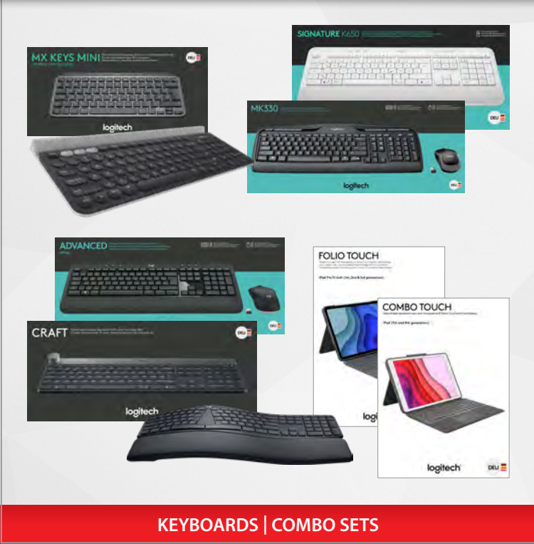
KEYBOARDS | COMBO SETS