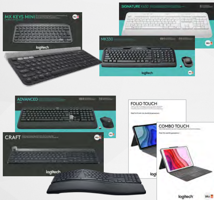
KEYBOARDS | COMBO SETS

We offer a wide selection of wired and wireless keyboards, folio keyboards for tablets, and combo sets (keyboard & mouse) in numerous sizes and with a wide variety of additional features.