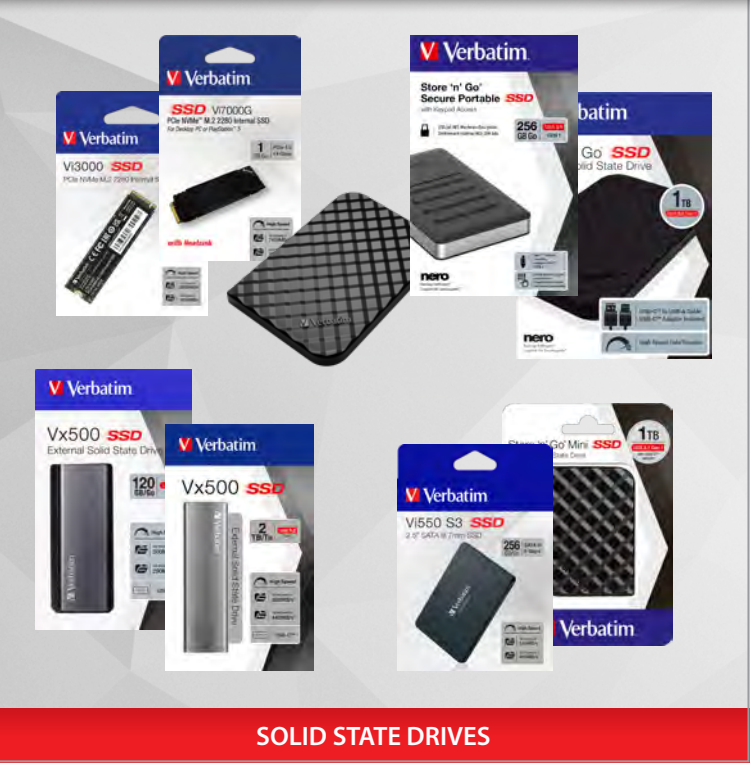
SOLID STATE DRIVES

Our flash memory range in the area of USB Flash Drives includes all common capacities and connection types. In addition, we supply USB Flash Drives with encryption and special formats.