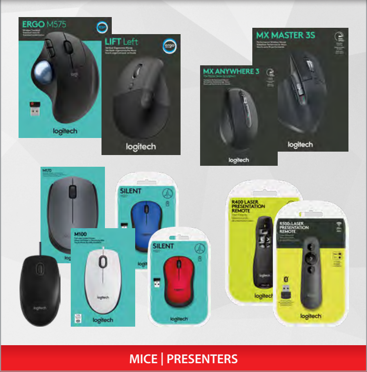
MICE | PRESENTERS