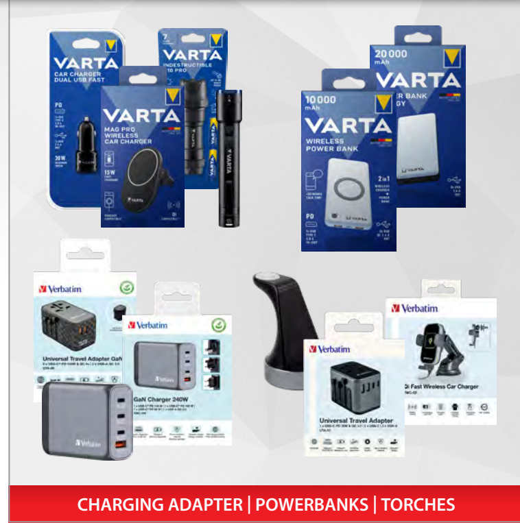
CHARGING ADAPTER | POWERBANKS | TORCHES

We offer a large selection of versatile charging adapters, high-performance power banks and reliable LED Torches.