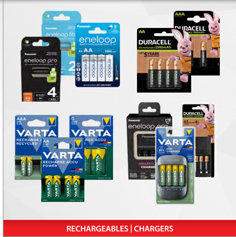
RECHARGEABLES | CHARGERS

In the area of Rechargeable Batteries, we also offer suitable chargers in addition to various designs and capacities.