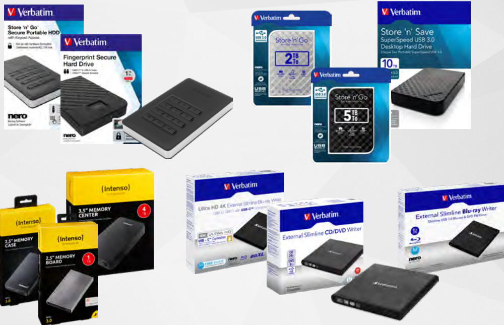
HARD DISK DRIVES | OPTICAL DISC DRIVES

We stock Hard Disk Drives in all common capacities, sizes and with all current interfaces. In addition, we offer various special Hard Disk Drives like security solutions. Our product range offers all common variants of internal and external Optical Drives (bulk & retail) as well as floppy disk drives.