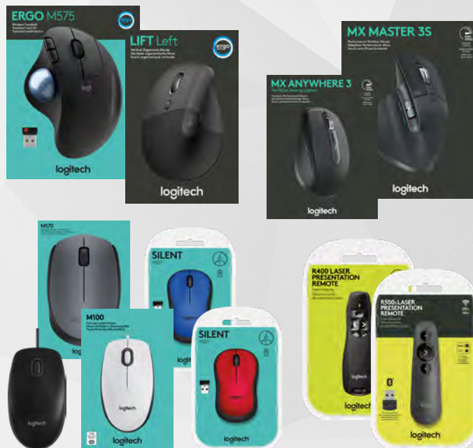
MICE | PRESENTERS

In the area of mice as well as presenters, Logitech offers a variety of innovations to make daily use as comfortable as possible – of course for both right- and left-handed users.