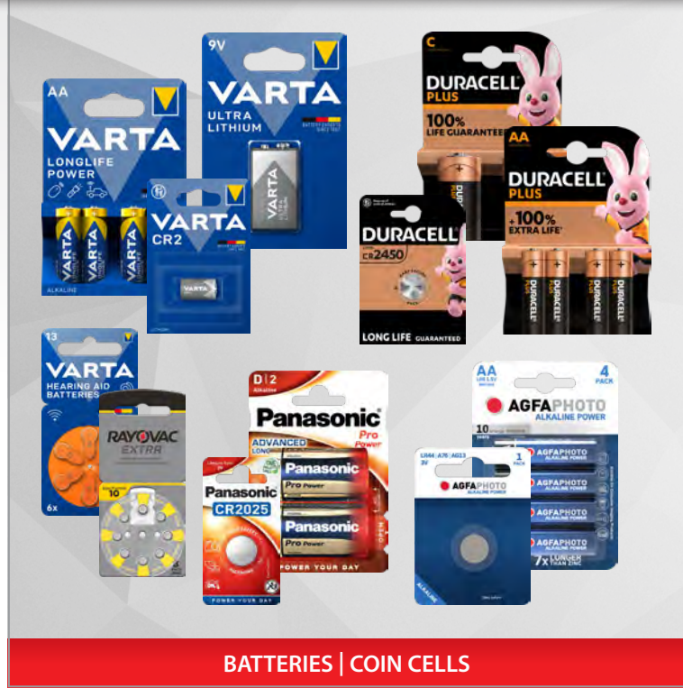
BATTERIES | COIN CELLS

Our energy product range includes a wide selection of different Batteries and Coin Cells from numerous well-known manufacturers.