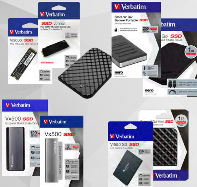
SOLID STATE DRIVES

As an extremely fast alternative to conventional Hard Disk Drives, our range of Solid State Drives (SSD) offers a particularly powerful selection of current internal and external models.